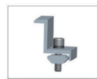
E : End clamp