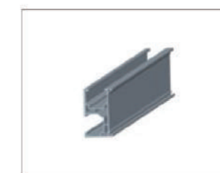
B : Rail