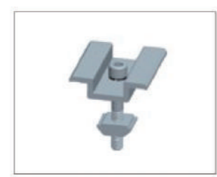
D : Inter clamp