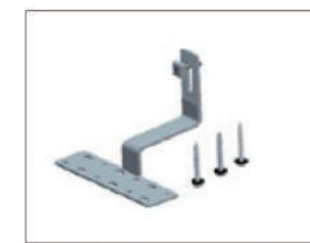
A : Tile roof hook