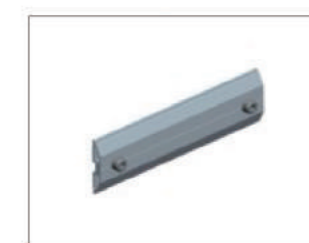
C : Rail splice